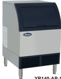
YR140-AP-161 / YR280-AP-161