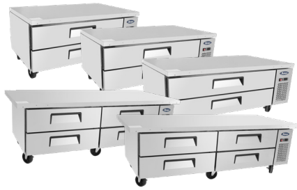
MGF8450GR MGF8451GR MGF8452GR MGF8453GR MGF8454GR