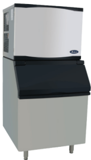
YR450-AP-161 / YR800-AP-261